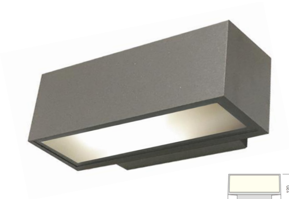
COMMERCIAL LIGHTING | WALL LIGHT LED