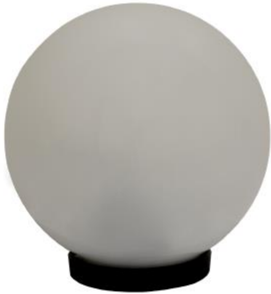
COMMERCIAL LIGHTING | POST TOP SPHERE